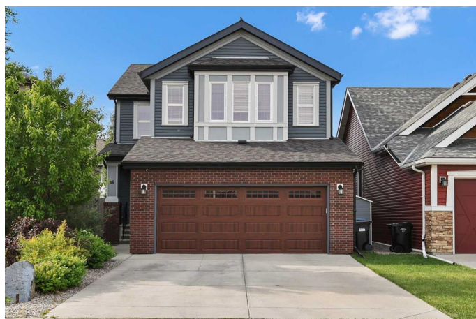
66 COPPERPOND HEATH SE

** Custom Former Show Home ** - Family Approved - Five bedrooms + two dens ** Extensive upgrades and superior quality, with 3,500 square feet of air-conditioned, luxurious living space. ** You will be impressed with the privacy of an oversized traditional homesite with a private south-facing backyard with a bespoke 13' x 12' covered deck. This seasonal, airy design provides relief from the sunniest to the snowiest days while providing an uninterrupted view of the surrounding gardens. Enjoy this convenient Copperfield Location - steps away from the ponds, Ice rink, parks, pathways, schools, shopping, soccer fields, skate park, healthcare, transit, South Pointe Hospital, and the major south expressways. Living a community lifestyle makes Copperfield an outstanding, safe, and secure community. Rich curb appeal with architectural features - dramatic roof lines, 24' x 21' attached garage with wood-style detailed door & full-sized concrete driveway, covered entry, and brick-faced front complete this spectacular elevation. There are extensive upgrades throughout, and the details are superb. This is a must-see home! Chefâ€™s kitchen includes granite countertops, custom light wood shaker style cabinets/doors, extension trims, high-end KitchenAid stainless steel fridge/dishwasher/microwave/wall oven, gas cooktop range with five burners, recessed lighting, oversized central island, peninsula island with a flush eating bar & black granite under mount sink, extra cabinet storage & a