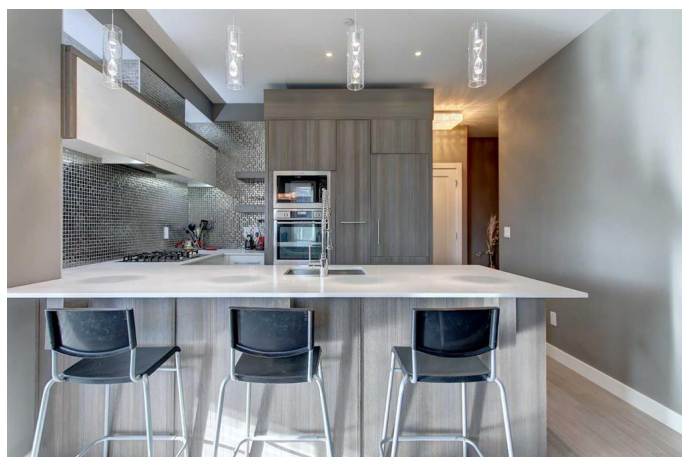
308-119 19 St NW, Calgary, AB

Welcome to Savoy by Truman Homes, where urban convenience meets contemporary style! Nestled in the heart of Kensington West, this vibrant community offers an incredible lifestyle—step outside to explore charming boutique shops, restaurants, bistros, and delis. Enjoy easy access to transit, the Bow River pathways, Kensington Village, and downtown, plus a well-established neighborhood with schools, parks, playgrounds, and more! This bright and unique corner unit boasts south east-facing exposures, flooding your space with natural light. Step into a welcoming entryway with a closet, leading you to a sleek, modern kitchen featuring high-end appliances, quartz countertops, and custom cabinets. The open layout flows effortlessly into the dining and living areas, the perfect spot to relax, with access to the south-facing balcony. The spacious primary bedroom features a luxury ensuite pampering you with a deep soaker tub, a large standing shower, and a stunning Kohler glass vessel sink. The flexible second bedroom is thoughtfully placed on the other side of the unit for added privacy. The spa-inspired main bathroom includes a huge walk-in shower and stylish glass vessel sink. Plus, the in-suite laundry offers additional storage and organization. Enjoy the added perks of a rooftop patio, secure titled underground parking, a separate storage locker, and bicycle storage. This stunning home is move-in ready—come experience the best of Kensington living today!